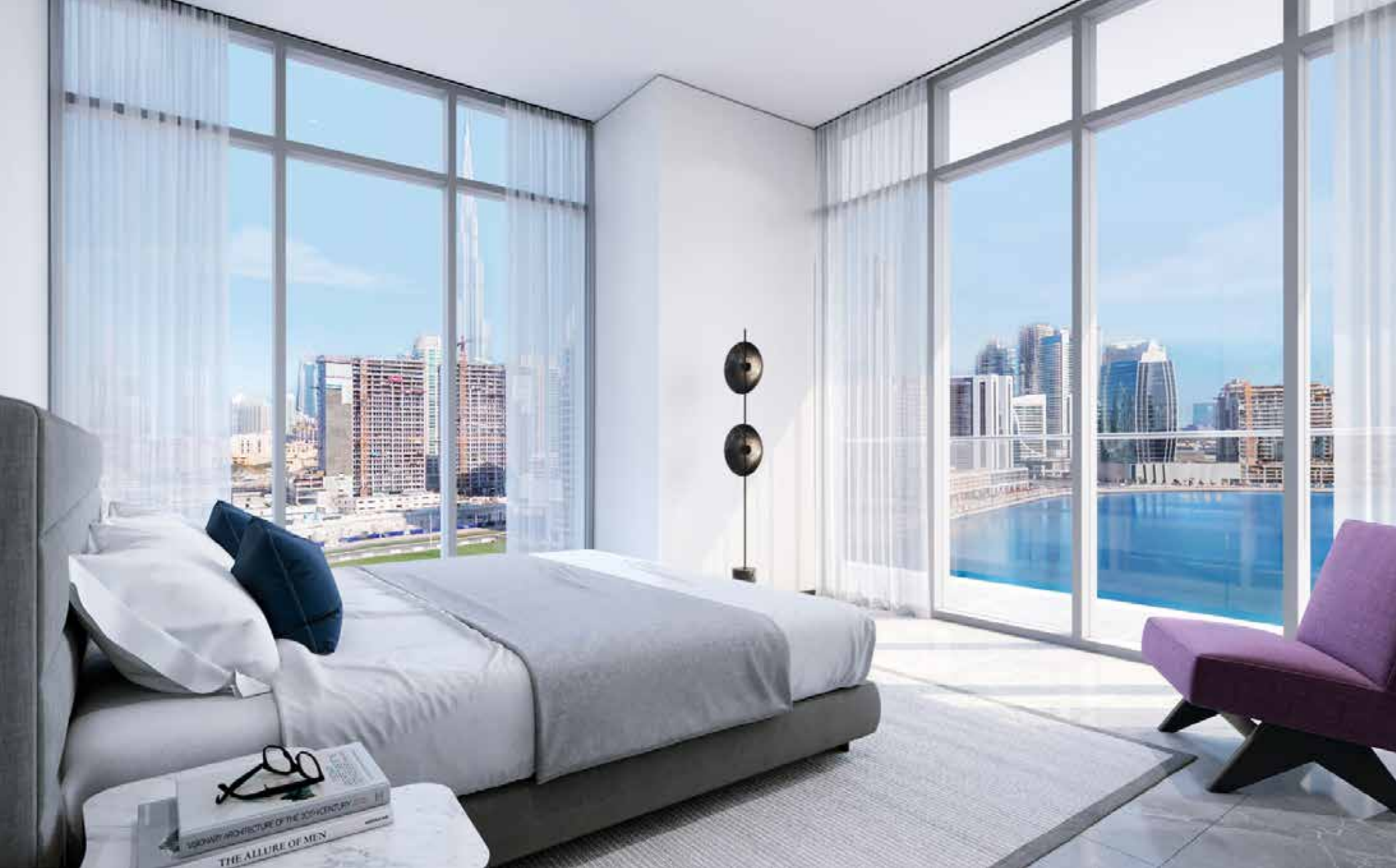
WATERFRONT VISTAS PICTURESQUE VIEWS OF THE CANAL